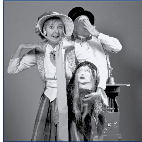
Organ Grinder Lola & Master Bob